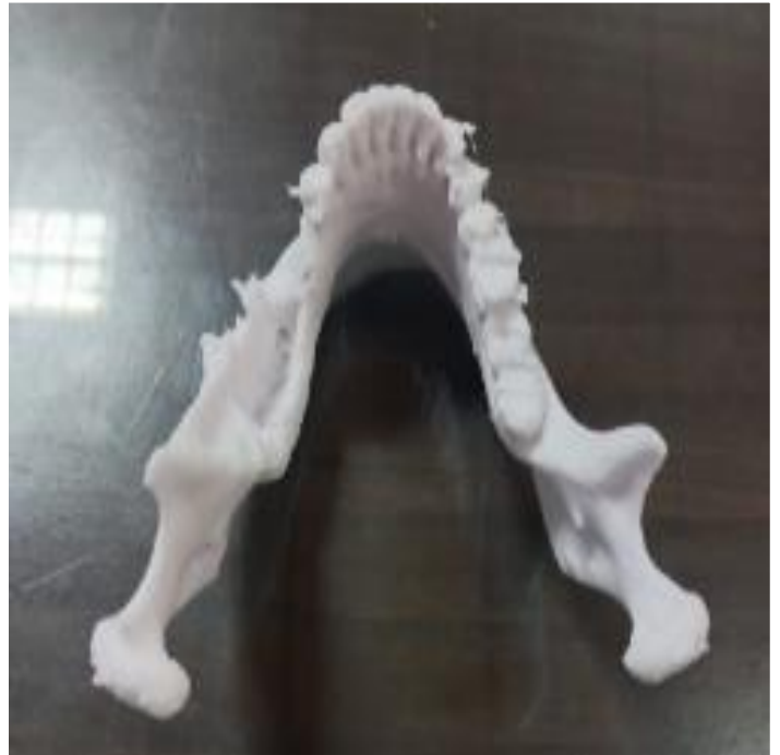
3D MODEL OF HUMAN JAW & TRAIN GEAR DESIGNED BY STUDENTS